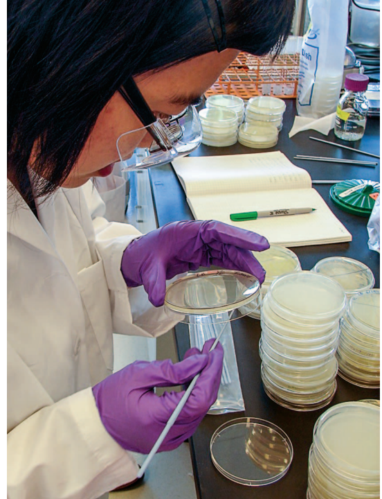
URE in action. Biofuel research engages a Berkeley undergraduate researcher during a summer internship with the Synthetic Biology Engineering Research Center (funded by NSF grant 1132670).

ADVANCES: Designers of UREs expect students to benefit from participating in a scientific laboratory but have not determined opti-